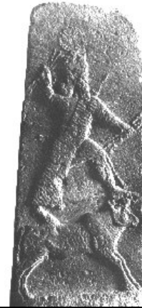
The storm god Hadad stands on the back of a bull. The pronged forks in the hands represent lightning.

When the Scripture says, "Therefore the people wander like sheep, they are afflicted, because there is no shepherd," it means that the people of the land were suffering , because the leaders were not directing them in the way of the Lord (2b). How the people needed a good shepherd ! Hence, God promised to punish these unworthy leaders of the nation (3a).